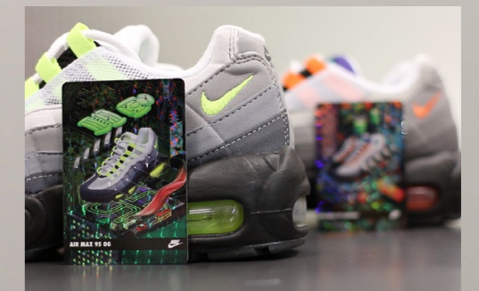
Special rare cards unlocked limited edition sneakers.