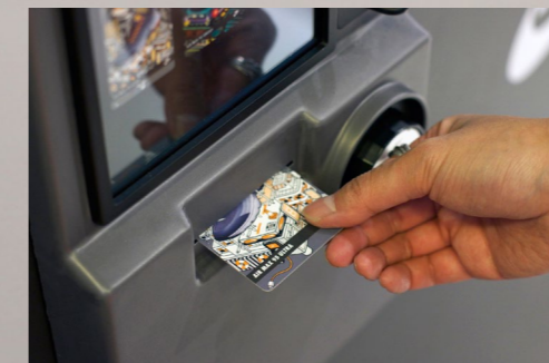
People came back daily to try and collect them all.